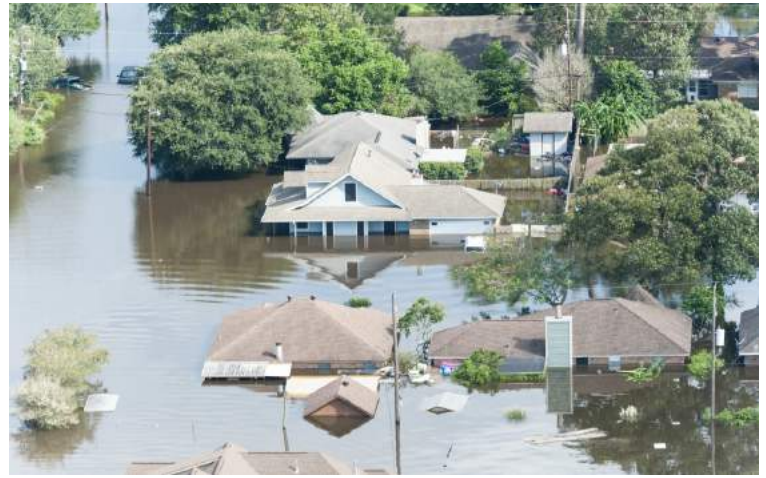
A neighborhood north of Beaumont, Texas, flooded by rains from Hurricane Harvey.